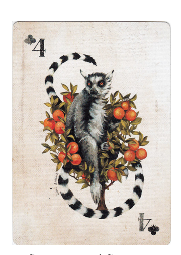
Stranger and Stranger

The activities described below are loosely based on the theme of "playing cards" which are defined as "a piece of specially prepared heavy paper, thin cardboard, plastic-coated paper, cotton-paper blend, or thin plastic, marked with distinguishing motifs and used as one of a set for playing card games." Common examples include the traditional 52-card Bicycle decks, Set, the I-Ching and Tarot